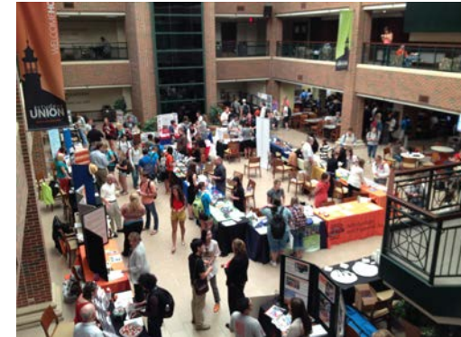
Study Abroad Day, held every September on OSU's campus

Students who are outbound for fall semester or the full academic year attend orientation in late March or early April. Students who are outbound for spring semester attend orientation in August. Sessions include information on academic credit and the course equivalency evaluation process (they will meet with you again to get courses approved for their degree plan), finances, safety, and cultural adjustment, and practical matters. Faculty-led, short courses conduct their own orien