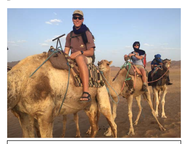
OSU students in Morocco take a break from their business development course on an excursion provided through their European host university.

Students submit an Enrollment Verification form by email or fax as soon as they have enrolled in classes at their host university. If they enroll in courses not previously evaluated, they must send a course description to the Student Exchange Coordinator along with the Enrollment Verification. Students are held responsible for courses listed on the Enrollment Verification and it is expected these courses will be listed on the host university transcript, unless students have indicated otherwise on a later Drop/Add form. The Enrollment Verification and the Drop/Add form are signed by both the student and the exchange coordinator at the host institution. National Student Exchange coordinators verify the number of hours of enrollment electronically during the first three weeks of classes.